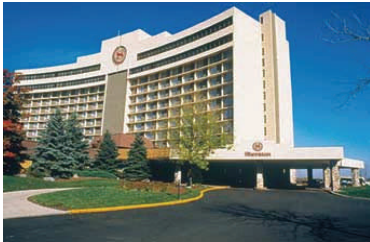
Sheraton Chicago Northwest Arlington Heights, Illinois